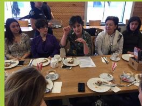
HR Breakfast by Marine Aznauryan